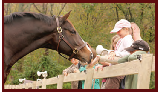
FOR THOSE WHO HAVE SERVED OUR COUNTRY AND SACRIFICED SO MUCH TO PROTECT OUR FREEDOMS!