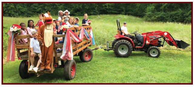
Visit our website for the date and times of our annual HHH Open Family Celebration Event