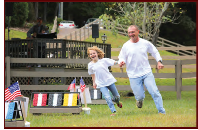
OUR MISSION IS CLEAR, THE NEED TO SERVE IS GREAT...