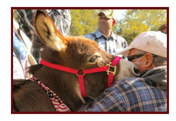
HHH RECOGNIZES POST TRAUMATIC STRESS DISORDER (PTSD) as the unseen enemy that follows all too many of our soldiers home from war... Every 65 minutes, at least

RENEW HEARTS • RESTORE RELATIONSHIPS • REBUILD LIVES